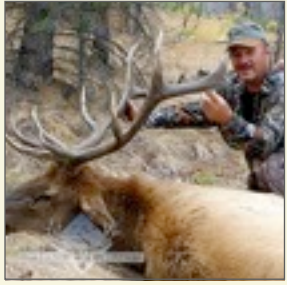
Bull elk on Big Creek the first day of hunting season.